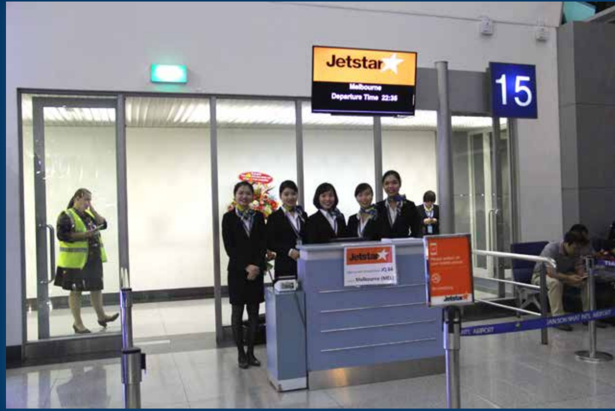
Boarding Gate Set-up - JQ

In May 2017, Australia-based Jetstar Airways (JQ) has launched direct daily flights from both Melbourne and Sydney to Ho Chi Minh City by the modern Dreamliner B787-8 to cater to soaring travel demand. Travelers could have better options to fly to either major hubs in Australia with very competitive air fares.