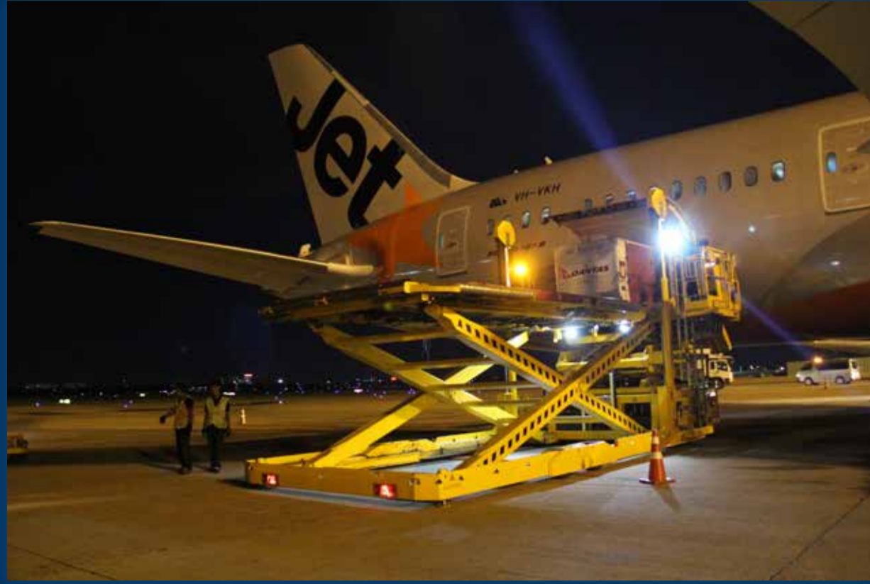
Ramp Services - JQ

June 2017 witnessed Thai AirAsia (FD) expanding business to Da Nang International Airport by operating daily flights using Airbus A320 with 180 seats linking Bangkok to the vibrant Da Nang City, Vietnam. The airport has delivered the impressive water salute to welcome the maiden flight. With FD in operations at this airport, AirAsia Group Airlines rank among the highest flight frequency operators in Vietnam.