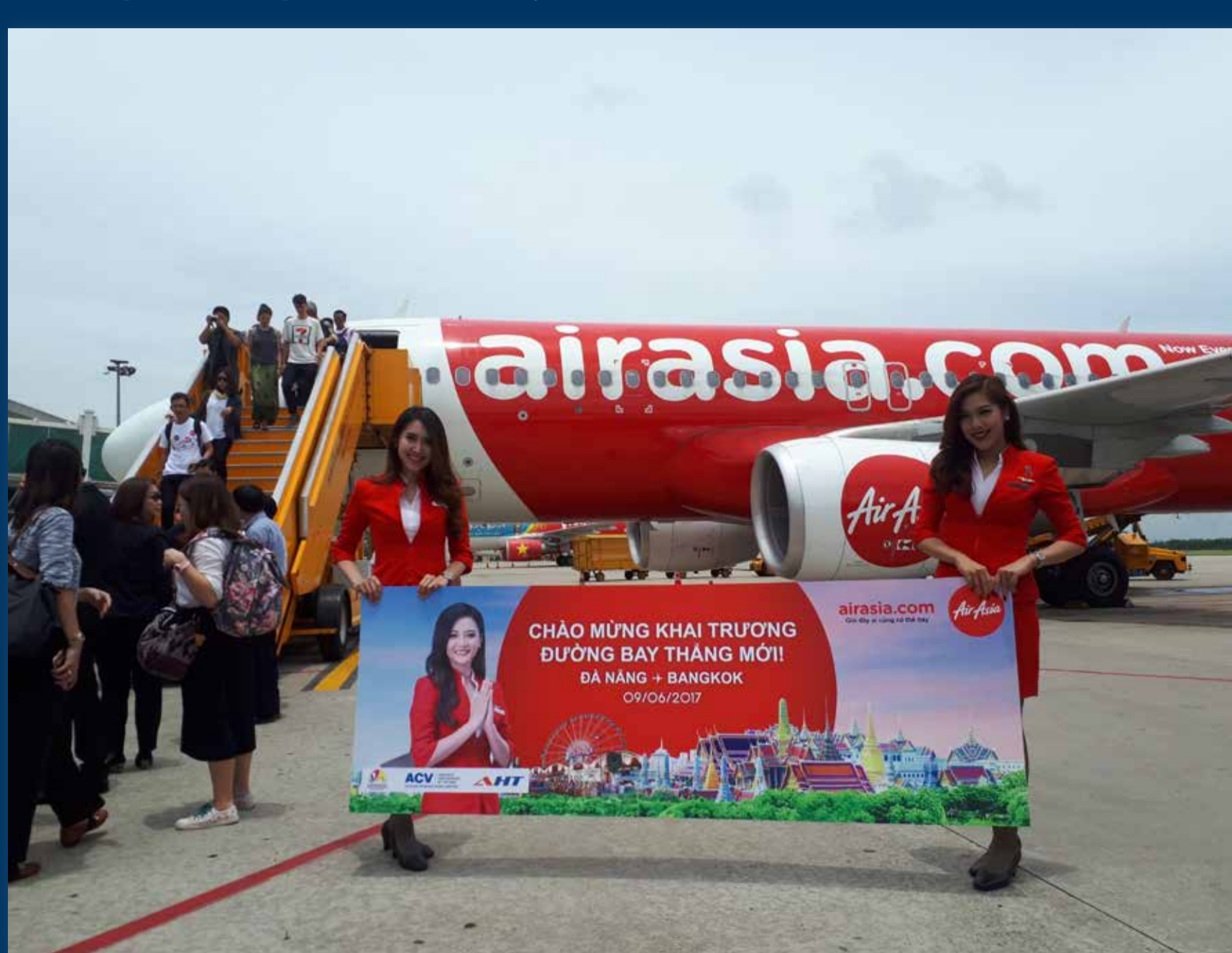
Welcoming - FD

June 2017 witnessed Thai AirAsia (FD) expanding business to Da Nang International Airport by operating daily flights using Airbus A320 with 180 seats linking Bangkok to the vibrant Da Nang City, Vietnam. The airport has delivered the impressive water salute to welcome the maiden flight. With FD in operations at this airport, AirAsia Group Airlines rank among the highest flight frequency operators in Vietnam.