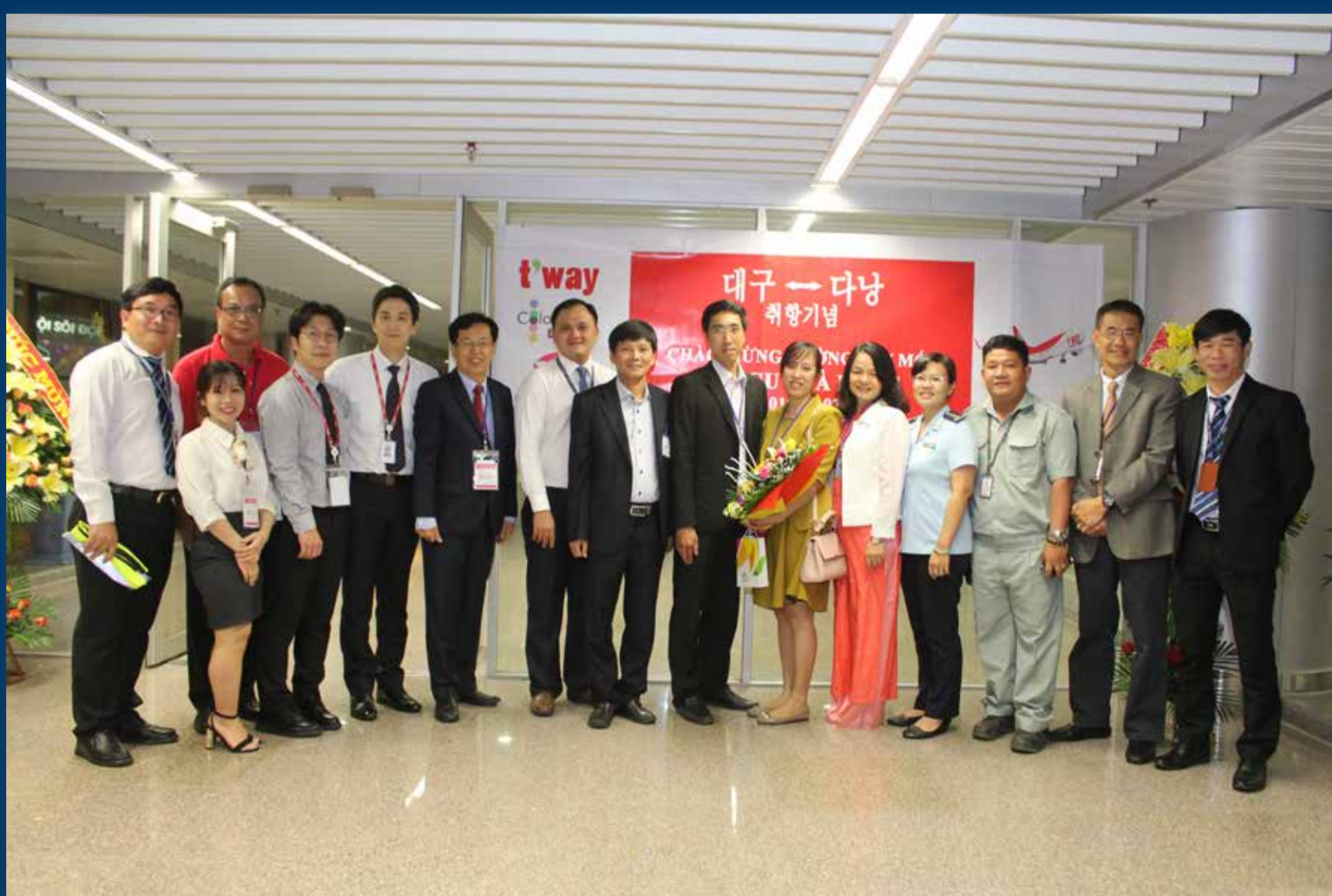
Welcoming - TW

Malaysia AirAsia (AK) increases operations to daily flights to Da Nang Airport bringing more chances for passengers to travel within the Southeast Asia region. The AirAsia Group is now operating all Airbus A320 in Vietnam.