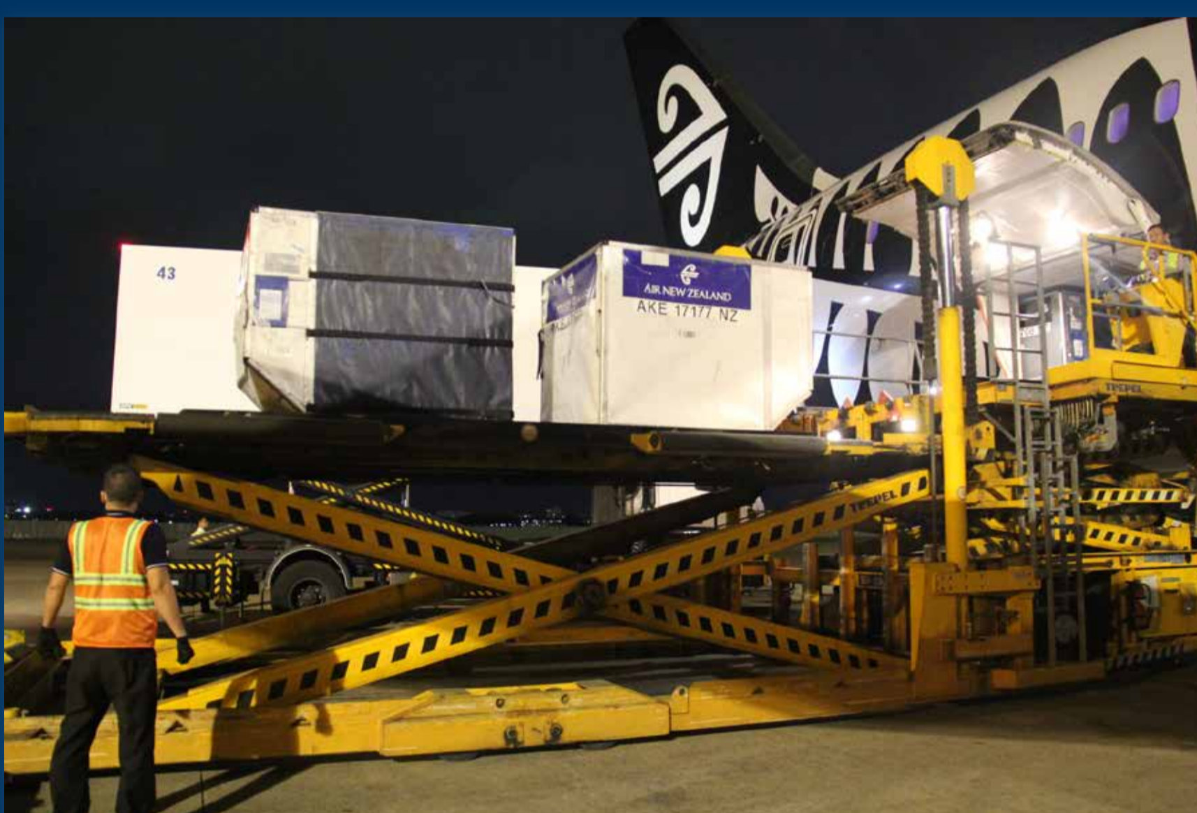
Ramp Services - NZ

Air New Zealand (NZ) – the flag carrier of New Zealand – re-launches Auckland – Ho Chi Minh City route with the extraordinary new Boeing B787-9 (302 seats). This is the first time that we service this new type of aircraft at Tan Son Nhat Int'l Airport. In-depth training and preparations have been well coordinated and executed for the assigned handling team.